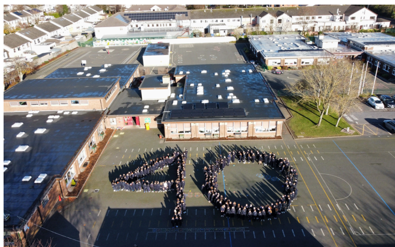
40 YEARS OF SCOIL SAN CARLO SENIOR NATIONAL SCHOOL 1985 - 2025