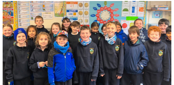
Some of our students dressed in blue to raise awareness for World Diabetes Day