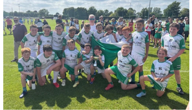
Some of our students in action for Confey GAA in recent finals.