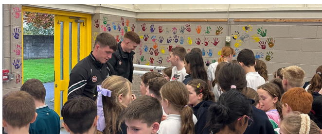
Our students met some Kildare stars in recent weeks on their visit to the school