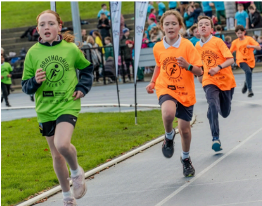
Some of our students in action on the track in Morton Stadium, Santry