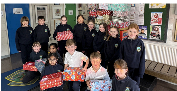
Some of our many students who engaged with this year's HOPE Christmas Appeal