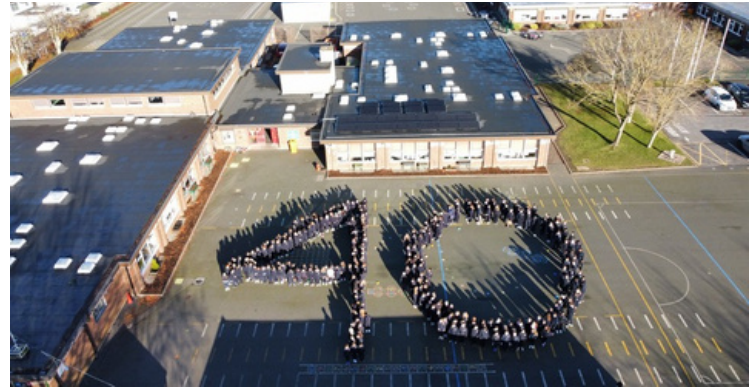
We had a fantastic week celebrating 40 years of San Carlo Senior School in May!