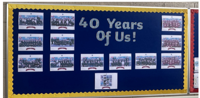
Our amazing students had their class photographs taken by our back-wall mural.