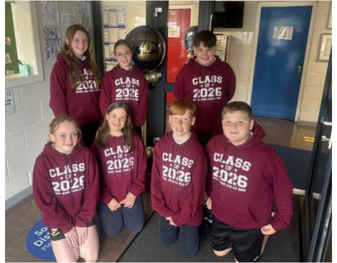
Our front of house team, welcoming guests to our whole-school assembly.

It was a wonderful week of celebration & a sincere thanks to the organising committee, who worked tirelessly to make it such a success.