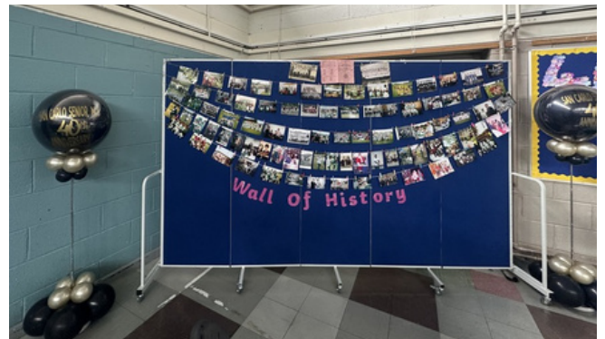
Our 'Wall of History', allowing staff and students alike to reel in the years.